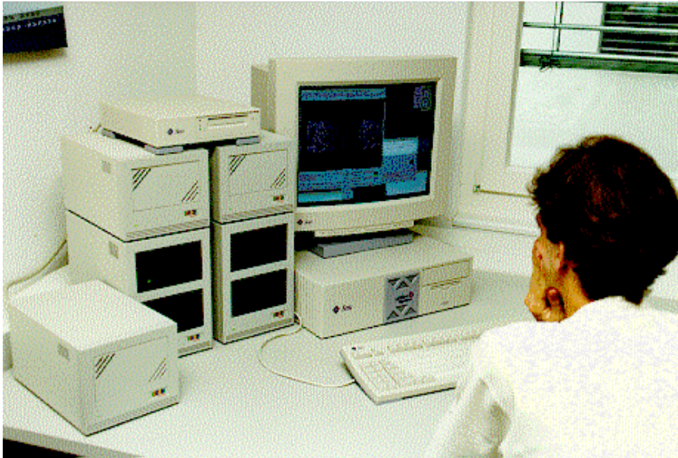
Figure 2: Digital aerial triangulation station at Swissphoto Vermessung AG

measurement without operator intervention. All the operator has to do is to re-measure these unacceptable points by moving the floating mark to their proper locations, if requested.